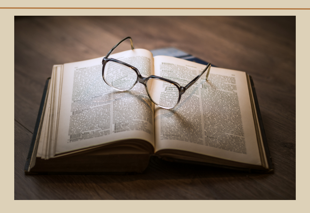
The objectives of the Research Policy are: